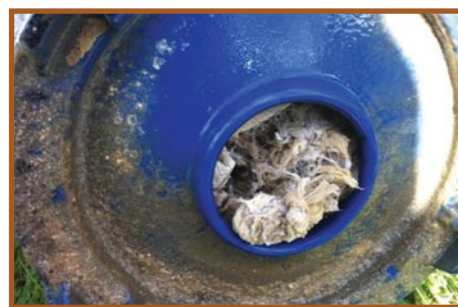
Ragged pump before installation of DERAGGER II ® anti-ragging device.

By maintaining a clean impeller at all times, the low voltage DERAGGER II ® anti-ragging device releases you from the time-consuming and costly necessity of manually lifting pumps – thus eliminating downtime and other costs associated with pump blockages. Reduced environmental incidents, together with less electricity consumption, result in a lowered carbon footprint.